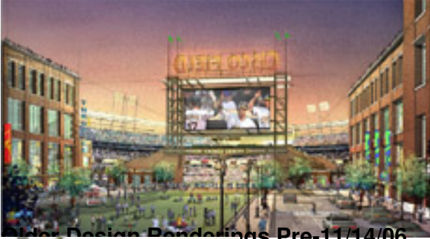
Arch Design Renderings Pre-11/14/06